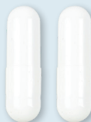
Other fumarates (DMF/DRF)

Pills are shown to scale but not actual size